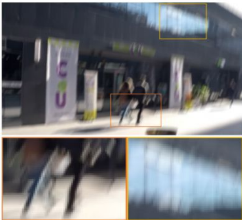
Input: Blurry, Low-resolution Image